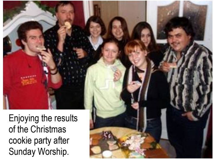
Enjoying the results of the Christmas cookie party after Sunday Worship.