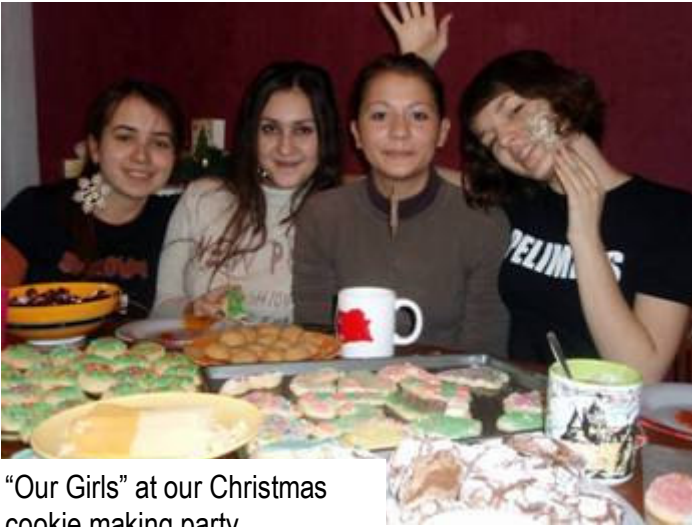
“Our Girls” at our Christmas cookie making party.